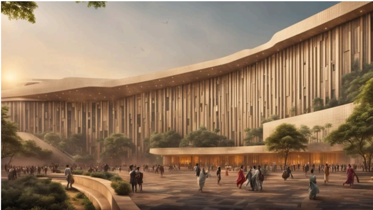
Habitat International Film Festival Kicks Off March 8, Showcasing Global Cinema with a Focus on Germany

Experience a cinematic journey at the Habitat International Film Festival 2024, featuring acclaimed filmmakers and a focus on women's stories. Engage with workshops and virtual reality programs for a truly immersive experience.