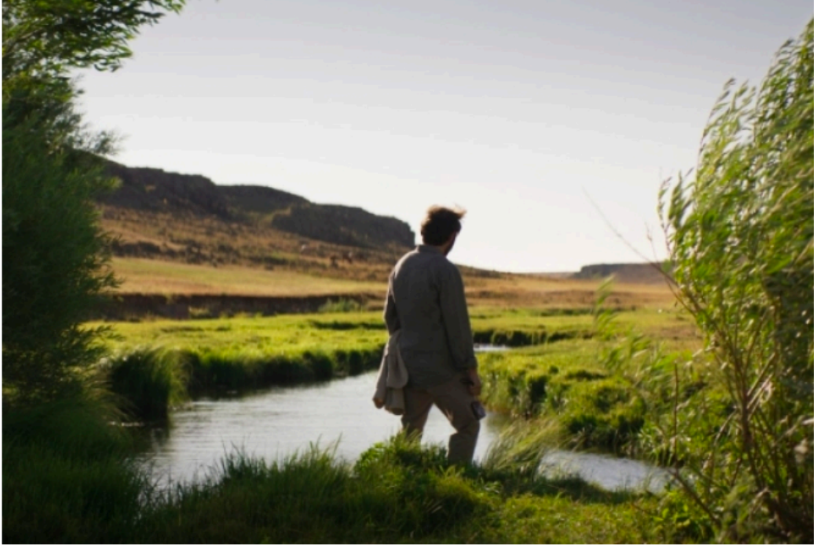
About Dry Grasses