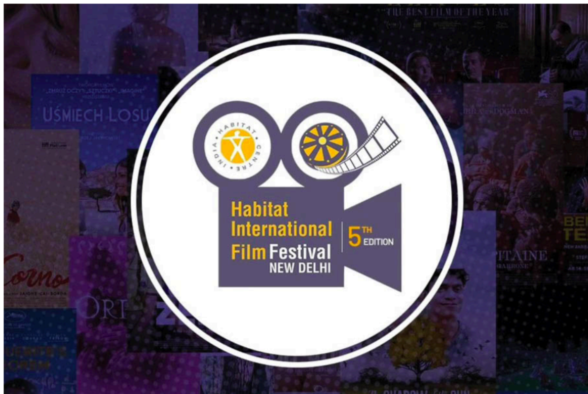
A poster of Habitat International Film Festival

The fifth edition of HIFF will showcase a series of Oscar and Golden Globe-winning films