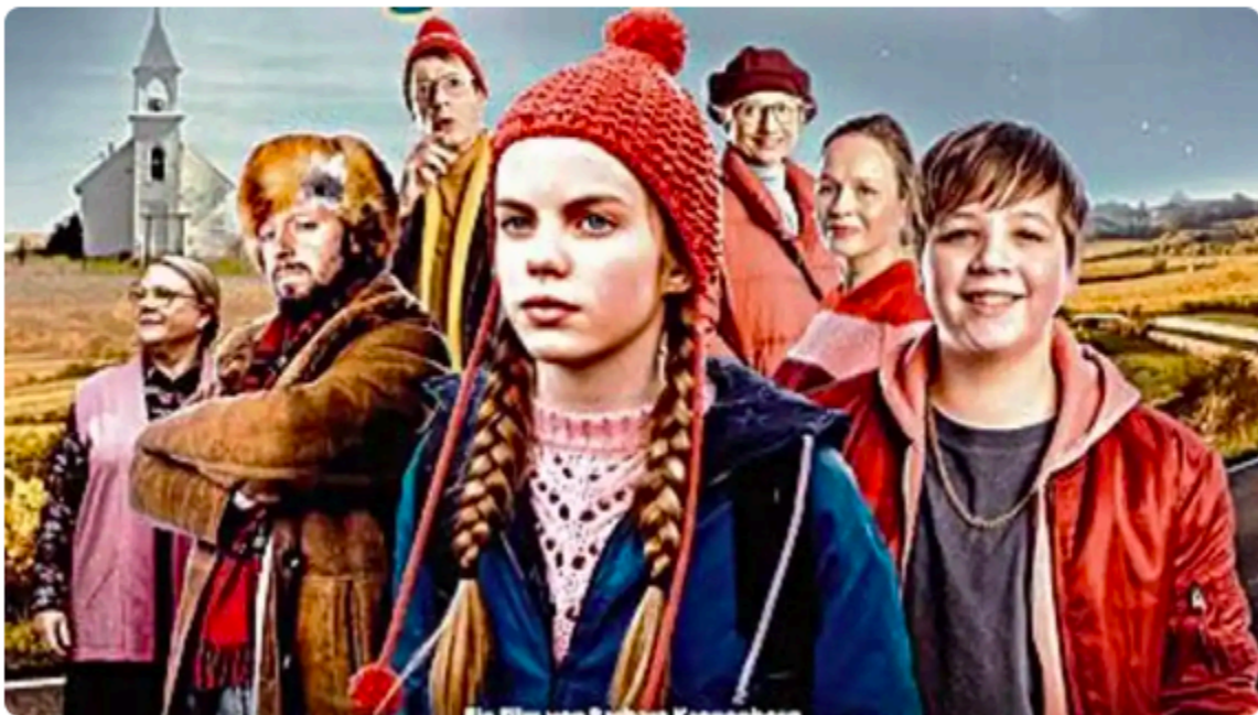
Poster of German movie, Mission Ulja Funk

An international film festival, a literature festival, a textile art exhibition, a buzzy summit for youngsters and a decadent food fest of Winter Black Truffles, the week's sure looking grand