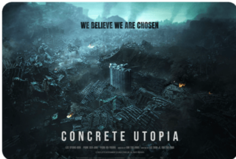
South Korea movie - Concrete Utopia