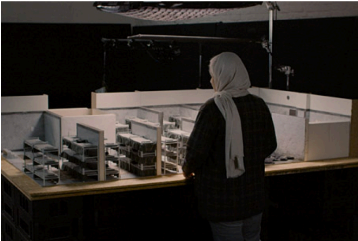
Winter in Tehran

Cinephiles are in for a treat as the annual event celebrating the best of acclaimed cinema 'Habitat International Film Festival' is back with a stunning showcase of over 60 films from 30 countries. Scheduled from March 8th to 17th at India Habitat Centre, this year, Germany is the focus country in cooperation with the Goethe-Institut / Max Mueller Bhavan New Delhi with support from Lufthansa Group. As the festival kicks off on International Women's Day, the festival curation puts a spotlight on women directors and movies with a focused lens on women-centric issues.